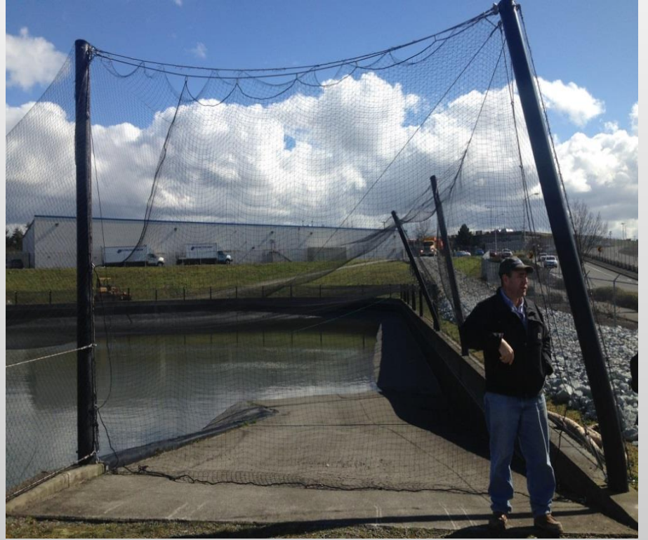
Failed Structural Posts