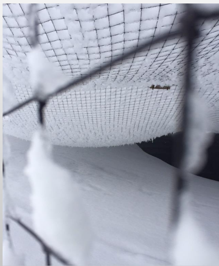
Structural components of pond netting system stressed from snow load