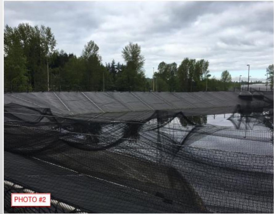
Examples of Damaged Netting and Cables